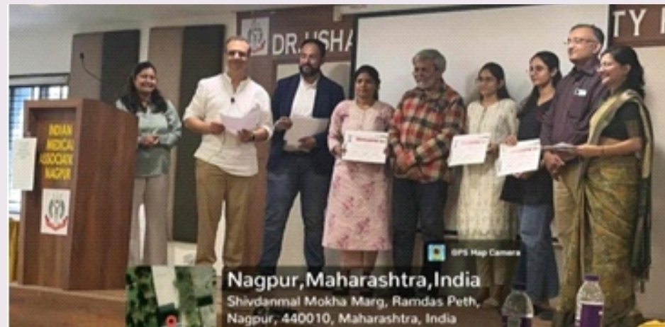
Postgraduate students from department of Ophthalmology participated in the Annual Dr. Nilima Pawde quiz organised by Ophthalmology Society of Nagpur on 09-02-2025