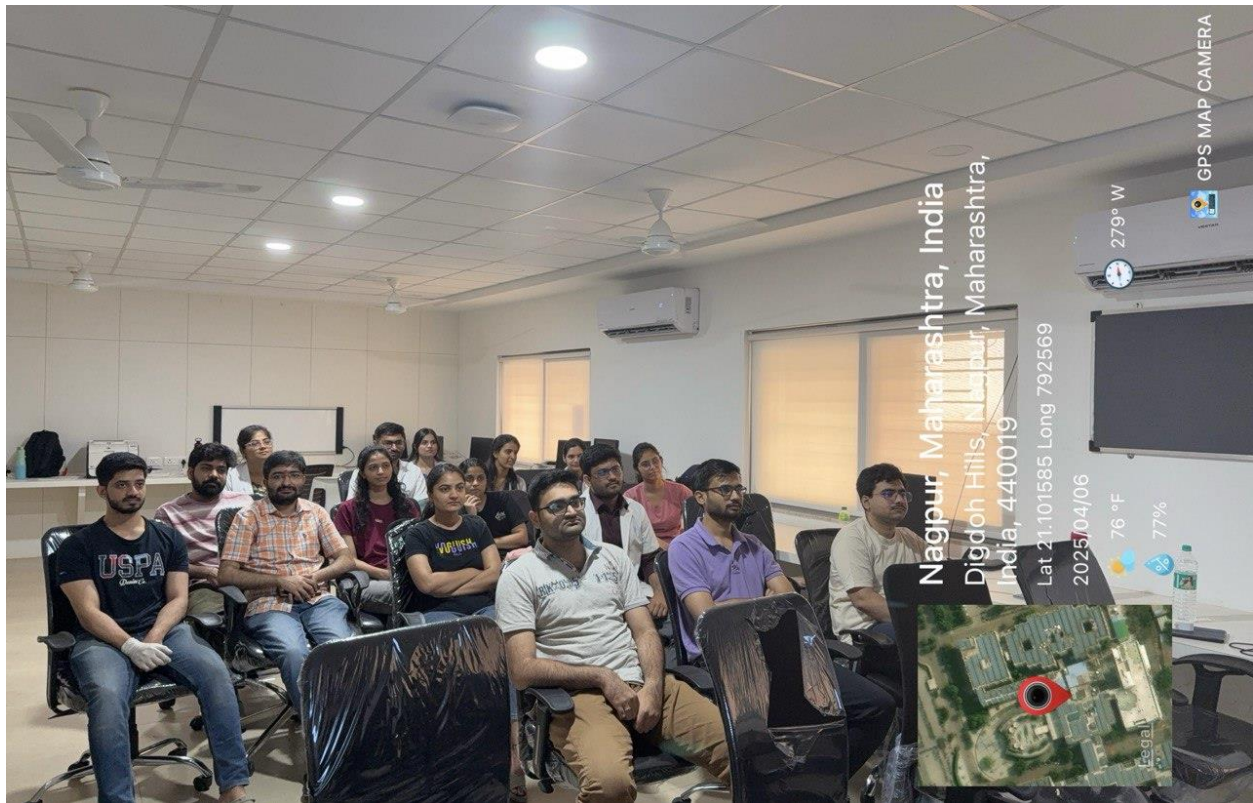
All the PG students of Dept of Radiology attended this lecture online