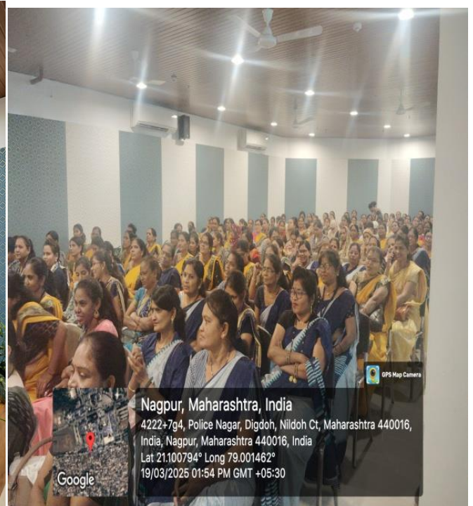
Nagpur, Maharashtra, India 4222+7g4, Police Nagar, Digdoh, Nildoh Ct, Maharashtra 440016, India, Nagpur, Maharashtra 440016, India Lat 21.100794° Long 79.001462° 19/03/2025 01:54 PM GMT +05:30