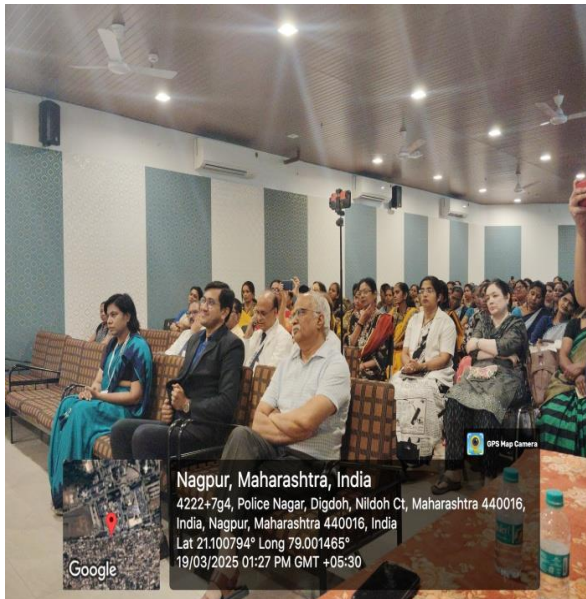
Nagpur, Maharashtra, India 4222+7g4, Police Nagar, Digdoh, Nildoh Ct, Maharashtra 440016, India, Nagpur, Maharashtra 440016, India Lat 21.100794° Long 79.001465° 19/03/2025 01:27 PM GMT +05:30