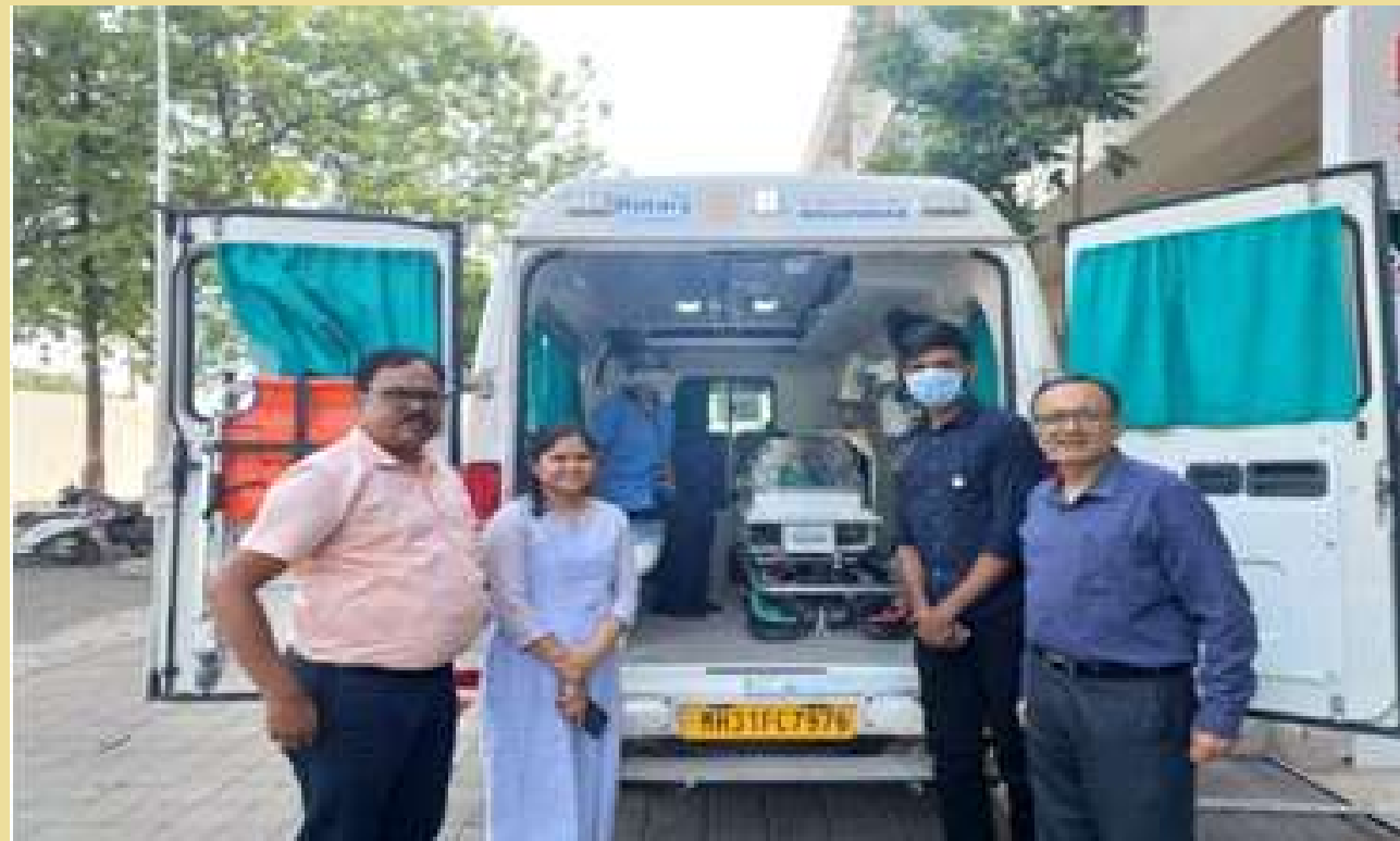
State of Art Neonatal Transport Ambulance donated by Rotary club downtown is fully in service