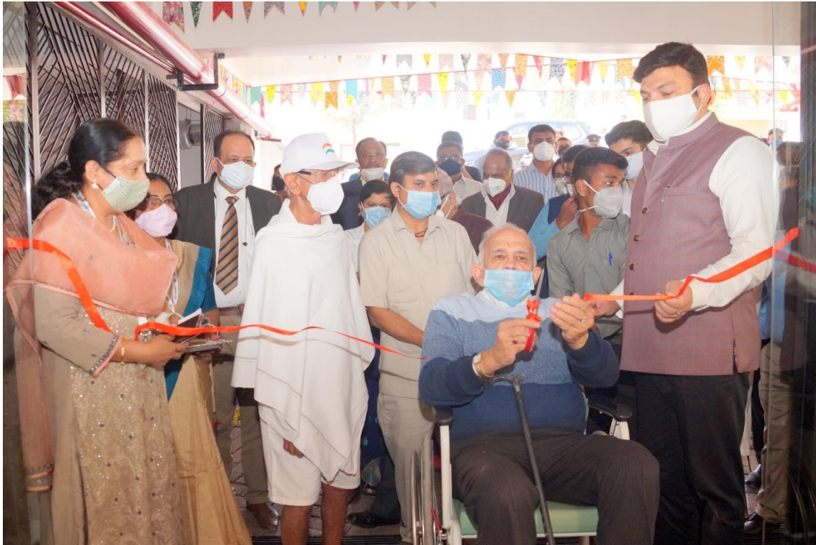
Inauguration on 22.2.21